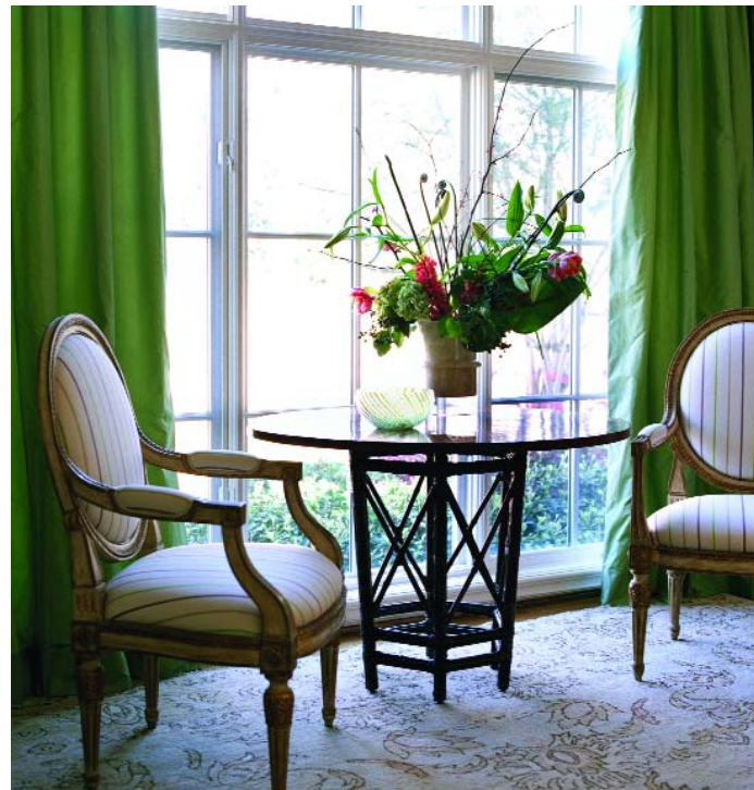
ABOVE: A large picture window in this formal living room designed by Linda Fritschy, ASID, provides a welcoming focal point. Two Louis XIV armchairs are covered in an informal cotton stripe and are paired with a custom wood topped table on a black bamboo base. Chartreuse, silk draperies frame this setting.

Many homeowners ask designers to solve storage problems, according to