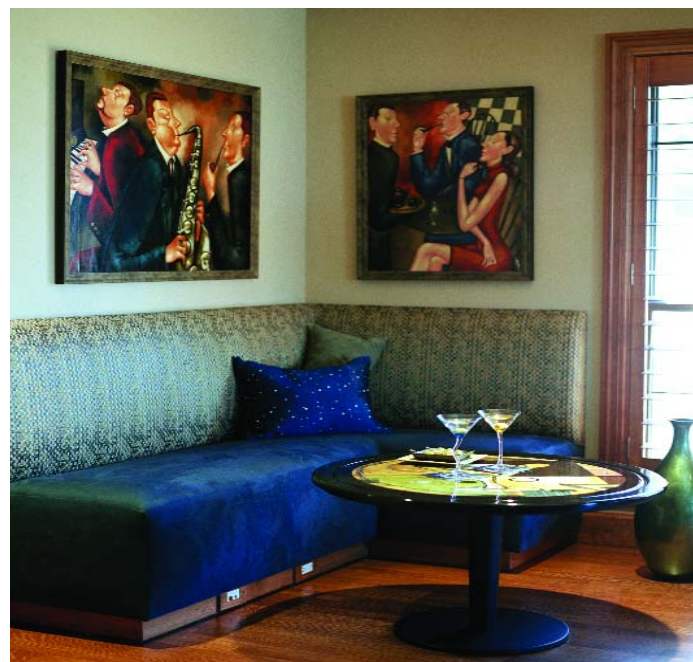
ABOVE: This banquette provides a cozy area for two or three in an open kitchen/family room floor plan designed by Linda Fritschy, ASID. The custom piece is covered in ultra-suede on the seat and a soil-hiding woven pattern for the back.