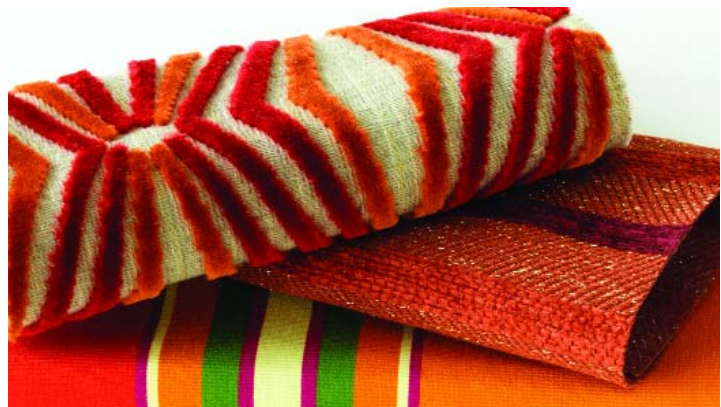
ABOVE: Designtex’s “Tangent,” “Metaphor” and “Parallel” in orange colorways brighten any room.