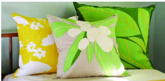
ABOVE: Spring is in the air at Hable Construction, with these latest pillows in garden-fresh patterns. Find Hable Construction products at Nest.