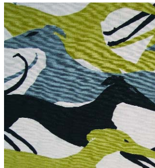
ABOVE: Sleek greyhounds are a graphic element in this F. Schumacher & Co. design adapted from a 1950s hand print. Fabric for the "Diamond Dogs" print is natural linen and cotton. Visit the Schumacher showroom at the Dallas Design Center for a look at more incredible fabrics.