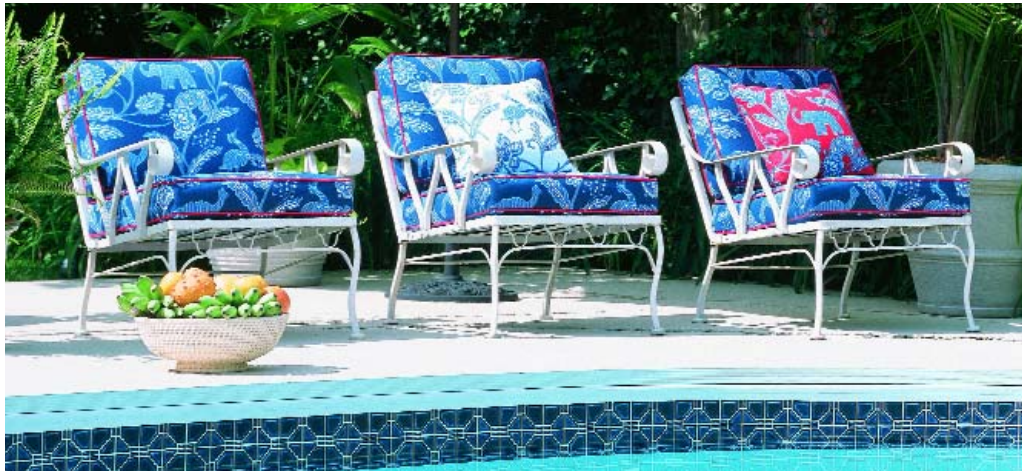
ABOVE: Thibaut's gone poolside with "Courtyard," its first collection of printed and woven fabrics ideal for accentuating indoor and outdoor living spaces, introduced in April. Shown here is "Batik" in bright blues and reds.