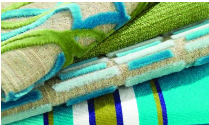
ABOVE: Beat the blues with these new fabrics from Designtex (from top to bottom): “Converge,” “Synch,” “Transpose” and “Parallel.”

LEFT: Go tropical with Company C’s Hawaiian-inspired “Hyde Hall” quilt and sham with hand-stitched scrolls and bold flowers. Find Company C at www.companyc.com .