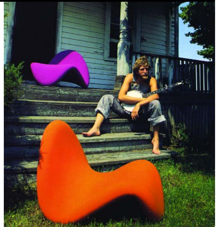
ABOVE: Paulin's Tongue Chair, 1967