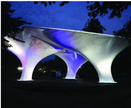
LEFT: The Lilas Installation for Serpentine Gallery in London. Hadid's para- bolic parasols made of fabric shade the lawn and garden.