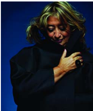
Pritzker Prize-winning architect Zaha Hadid, who designs furniture as well as buildings, was named Designer of the Year at the Maison Objet 2008 fair in Paris.