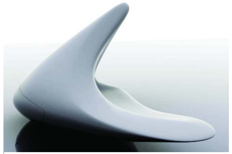
RIGHT: The Belu Bench that Hadid created for art dealer Kenny Schachter may be used as seating or for a table.