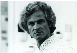
Pierre Paulin , Designer of the Year at Meuble Paris 2008, has been designing modern furniture for more than 50 years.