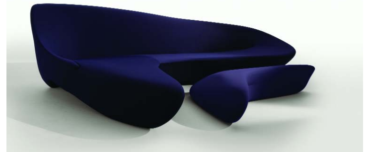
BELOW: Hadid's otherworldly Moon System Sofa and ottoman for B&B Italia may be ordered through Mody & Mody in Houston. The sofa is $12,460; ottoman, $1,749.