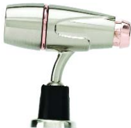
BELOW: Magnetic grill light, $25, Smith & Hawken