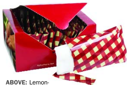
ABOVE: Lemon-scented hand-wipes, $7 for a 24-count pack, Sur la Table