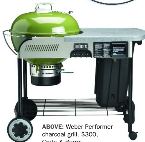
ABOVE: Weber Performer charcoal grill, $300, Crate & Barrel