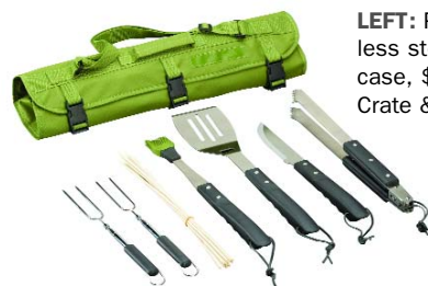
LEFT: Portable stainless steel tool set in case, $43, Crate & Barrel