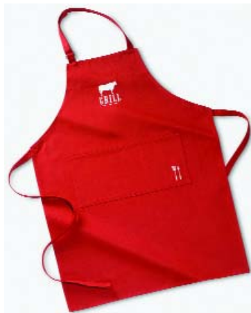
LEFT: Grilling apron, $34 for personalized, $24 for plain, Williams-Sonoma