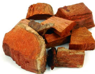
ABOVE: Mesquite wood chunks, $6 for a 4-pound bag, Goode Co. Also available in apple, alder, cherry, oak and pecan for varying amounts and prices