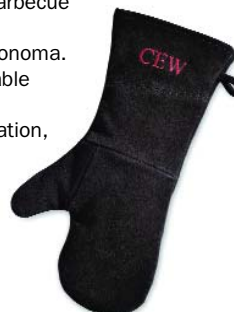
RIGHT: Monogrammed cowhide barbecue mitt, $30, Williams-Sonoma. Also available without personalization, $20