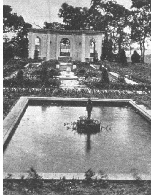
RIGHT: The beautifully landscaped grounds with views of Clear Lake were by Houston landscape architect Mason C. Coney. The fountain no longer is there.