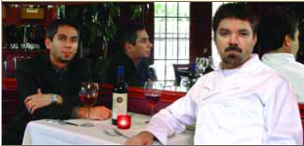
OPPOSITE PAGE: At Rouge, jewel tones add drama to the downstairs dining room. Dishes, clockwise from top, are: Raspberry Panna Cotta, Shrimp with Brandy Sauce and Beef Fillet with Bleu Cheese and Green Peppercorn Sauce.

Rouge, a stylish two-story bistro located a bit east of the Montrose intersection at 812 Westheimer, is housed in a building that began life as The Plant House.